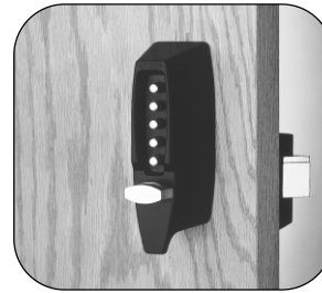
Rim Deadlocking Latch

Models 7004, 7014 Deadlocking Latch 1/2" (13 mm) throw, flat front Primary or auxiliary Lock Automatic relock